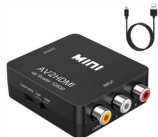
DD497 AV to HDMI converter HDMI 1080P/720P@60Hz Input: RCA Output: HDMI Powered by Mini USB Black